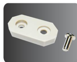
Wall brackets for Big plastic box 塑料盒尼龍掛牆鉤 MODEL:MG Material:nylon Packing:4pcs/set