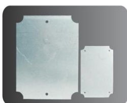
Steel mounting plate 金屬底板 (鍍鋅)